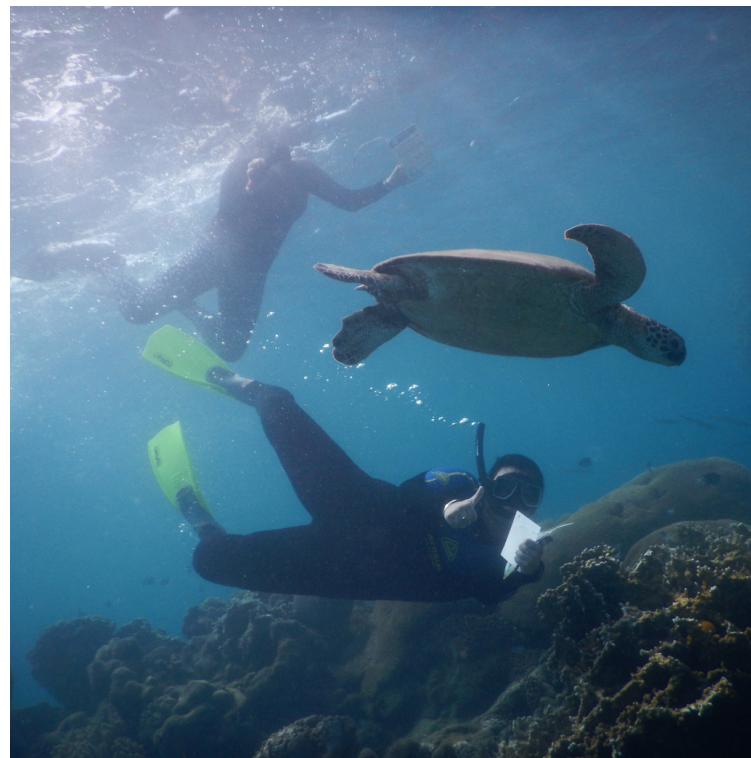
Marine classroom in the Whitsundays.

The three natural values deemed most important to the community were coral reefs, catchments and estuaries, and mangroves. The top priorities that emerged from Traditional Owner and community feedback were climate change, litter and waste, revegetation, and water quality.