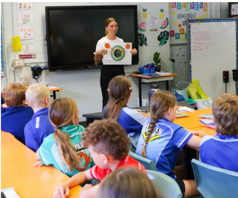
Waste education program at Cannonvale State School.

CAP Leader staff have taken knowledge and skills they developed during the CAP development process and embedding them into new organisations they are currently working with. Additionally, Reef Catchments continue to translate the needs of the community into ‘shovel ready’ prospectus documents which can be marketed to private investors.