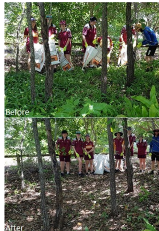
Sarina State High School students removed 90kg of weeds at Grasreef Beach so native coastal vegetation can grow.

Expanding community participation is key for success to support delivery of on-ground CAP projects. A citizen science calendar is being piloted to bring more visibility for participation opportunities.