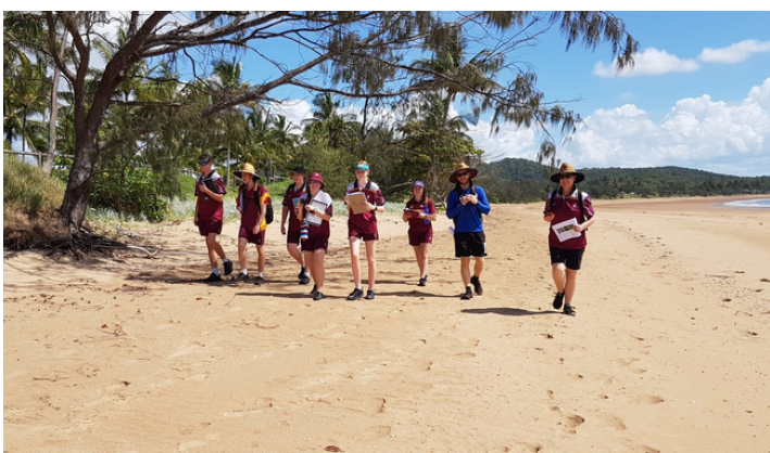
Sarina State High School students learning about coastal rehabilitation at Grasstree Beach.

The Community Action Plan (CAP) Program is a pilot program for place-based collaborative planning and delivery to enhance community Reef protection and delivery to enhance community Reef protection for the Great Barrier Reef World Heritage Area. CAPs connect community aspirations with regional and Reef-wide priorities by: