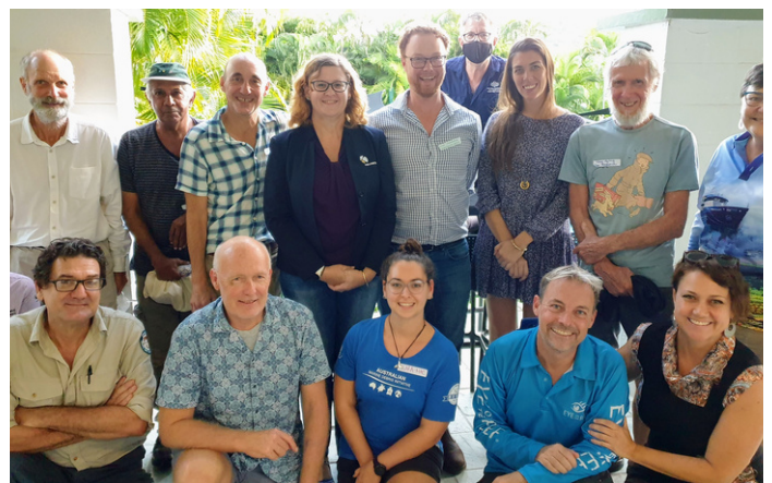
Top: Maggie on Tap event. Bottom: 16 experts from 14 agencies presented at the Monitoring on Magnetic Workshop.