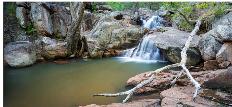
Top: The CAP 'Our World Heritage Island' Steering Group. Bottom: Swimming hole near Endeavour Falls.

The Community Action Plan (CAP) Program is a pilot program for place-based collaborative planning and delivery to enhance community Reef protection for the Great Barrier Reef World Heritage Area. CAPs connect community aspirations with regional and Reef-wide priorities by: