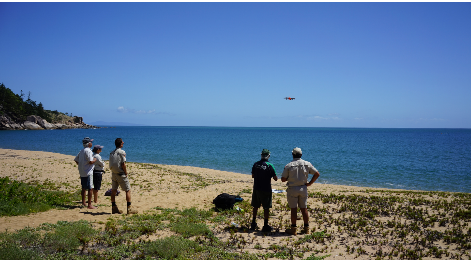
Drone training.