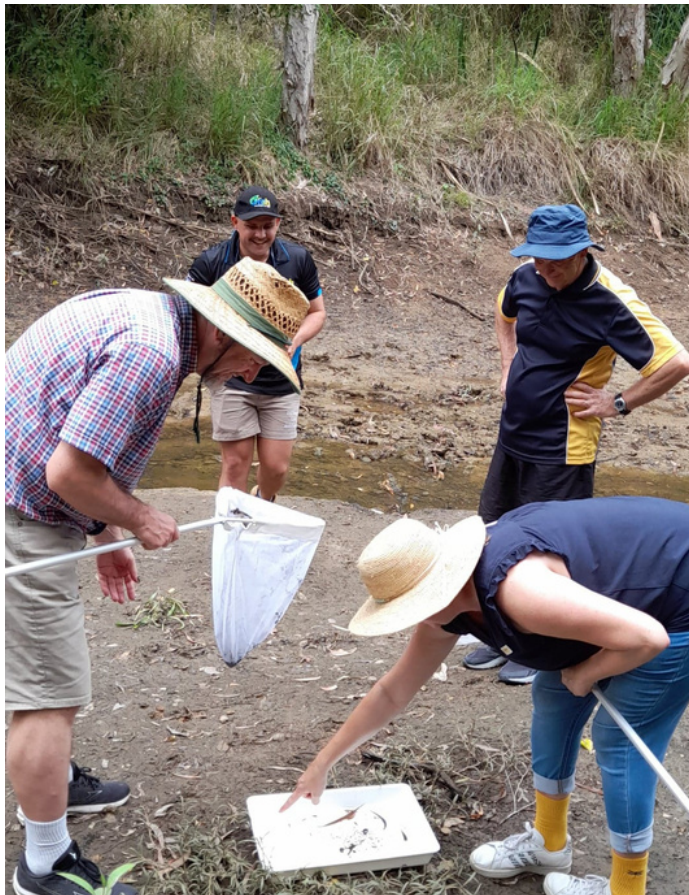
Magnetic Island State School teachers training for the Adopt-A-Creek Program.