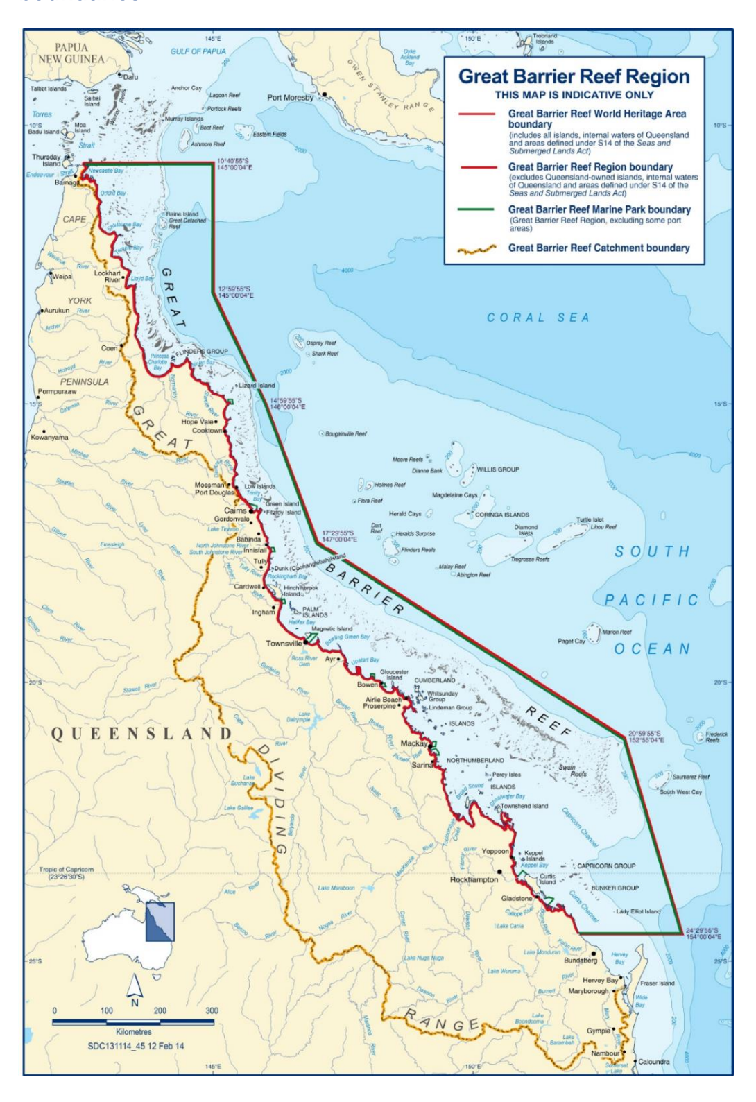
Appendix B: Map of the Great Barrier Reef World Heritage Area and Catchment boundaries